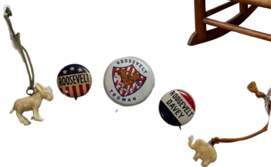
Campaign buttons and political party charms. From L to R: Democratic donkey charm; 1940 FDR button; 1944 Roosevelt-Truman button; 1940 Roosevelt-Davey button; Republican elephant charm.